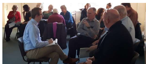
Capturing the Learning: Misesan Cara members and staff discussing the penultimate draft of the meta-evaluation report, December 2018

While there are challenges in certain areas such as the sustainability of project activities and the systematic management of project data, the transformative nature of the work being done is also evident.