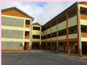
The well-constructed, solid buildings of the Ruben Centre contrast with the general infrastructure in Mukuru kwa Ruben

afternoon, so that “the teaching staff are no longer overcome by chronic exhaustion and at last have a working pattern which permits proper preparation of classes”.